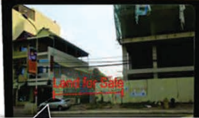
Land Size 507m 2 for Sale at $2700/m 2 (LMAP) on Kampuchea Krom Blvd (Street 128), Phnom Penh for Office Space, Showroom and Investment