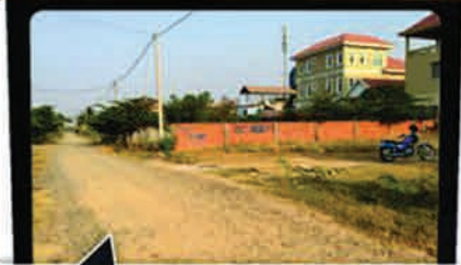
Land 18m x 30m for Sale at $299 990 Phnom Penh Thmey, 140m from Hanoi Blvd and 300m from National Bank of Cambodia

Buy, Rent & Sell Land, Houses, Villas, Condos, Hotels & Warehouses | Property Valuation for Banks from Taiwan & Vietnam | Bank Loan Consulting and Paper Work for Banks | Looking to buy Commercial Land, Residential Land and Industrial Land in Phnom Penh Capital from $99,990 to $49,999,990. 15%-25% Lower Than Market Price by Quick Cash Payment.