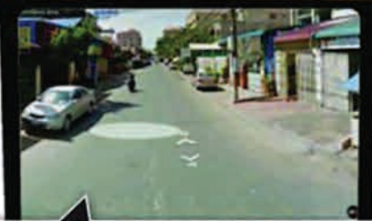
Land 16m x 30m for Sale at $799 990 (LMAP 479m 2 ), Street 608, Toul Kork, Phnom Penh for Serviced Apartment and Office Building