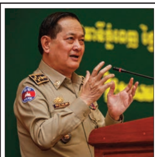
Police to Start Night Inspections of Migrants