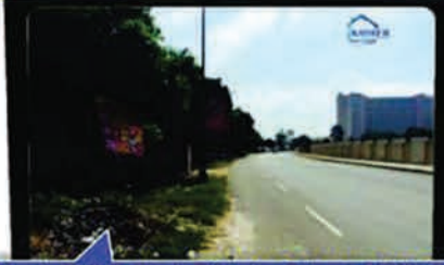
Land 6841m 2 (Hard Title) for Sale at $1599/m 2 , Sangkat Chrouy Changva, Phnom Penh near Sokha Hotel for Hotel and Condo Development