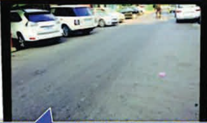
Land 560m 2 (LMAP) for Sale at $3799/m 2 , Sangkat Phsar Thmey III, Daun Penh, Phnom Penh for Serviced Apartment, Hotel and Office Building