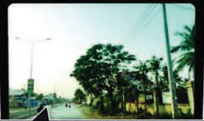
Land 53 538m 2 (Hard Title) for Sale at $459/m 2 on Chea Sophara Street (Street 598), Khan Russey Keo, Phnom Penh Real Estate Development