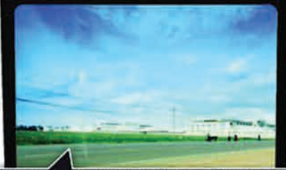
Land 21ha (Hard Title) for Sale at $149/m 2 on National Road #4, Posenchey, 6km from Airport, Phnom Penh for Real Estate Development

Office: #736, Kampuchea Krom Blvd (St 128), Phsar Depo II, Phnom Penh Cell: +855 (0)12 96 2000, +855 (0)16 96 2000 & Tel +855 (0) 23 884 887 Email: info@khmerrealestate.com.kh Web: www.khmerrealestate.com.kh