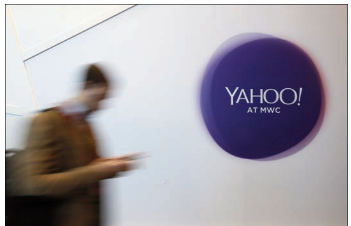
A man walks past a Yahoo logo in Barcelona.

Chief executive Marissa Mayer was excluded from that committee in part because of the potential for a private-equity bid involving the CEO as an investor, a person said last month.