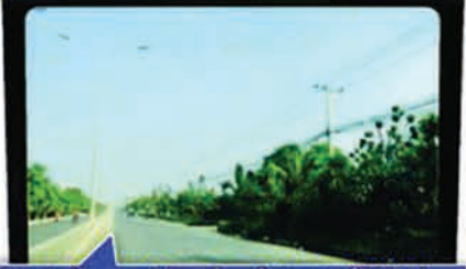
Land 80m x 60m for Sale at $750/m 2 on Chea Sophara Street (Street 598), Khan Russey Keo, Phnom Penh for Showroom & Investment