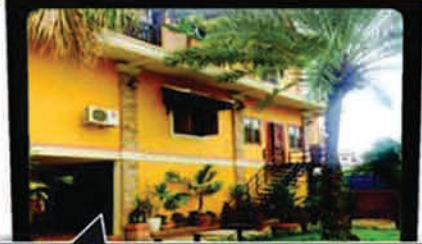
Villa for Sale at $1 499 990 on Land 1250m 2 4 Bedrooms, Big Warehouse, 250m from Boeung Kok Lake Project, Phnom Penh