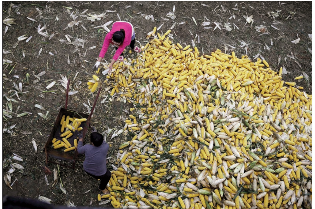
Farmers collect corn at a farm in Gaocheng, Hebei province, China, last year.

TAIPEI - CTBC Financial Holding Co., the parent of Taiwan's biggest credit card issuer, is in talks to buy a stake of up to 40 percent in Thai firm LH Financial Group's banking unit, a person familiar with the matter said yesterday. The potential deal is a non-binding proposal worth around $450 million subject to regulatory clearance in both Taiwan and Thailand. Officials at the financial services firm could not be reached for comment. The potential deal to buy into the unit, LH Bank, is the latest expansion by CTBC into China and Southeast Asia, as it seeks to expand revenue away from its competitive home market. CTBC has previously said it wants overseas banking revenue to grow from its present 36 percent to 50 percent of total revenue in five years. It currently has 100 overseas branches, offices and subsidiaries, with Southeast Asia a key focus. LH Financial has long sought a partner for its banking unit to boost its electronic banking and fend off fierce competition. LH Financial reported a net profit of $47 million in 2015. It had assets of about $5.5 billion at the end of February, according to data from Thai stock exchange.