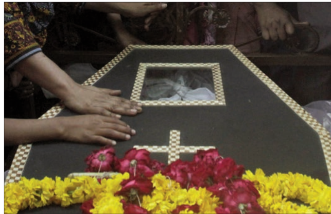
Family members touch a coffin of a relative who was killed in a blast outside a public park on Sunday during a funeral in Lahore, Pakistan, on Monday.

dent faction of the Pakistani Taliban that also previously declared loyalty to the Islamic State group, has carried out five major attacks in Pakistan since December.