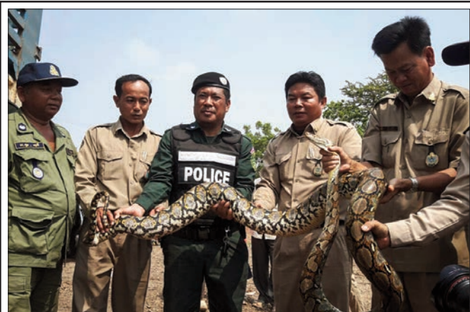
Police officers hold one of 17 pythons seized from a truck in Kandal province on Monday, in a photograph provided by the anti-economic crime police.

Officials at the Appeal Court could not be reached yesterday. The Russian Embassy in Phnom Penh did not respond to a request for comment.