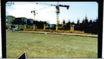
Land 2717m 2 (LMAP) for Sale at $4699/m 2 next to The Bridge Condo and Toyoko Inn Hotel, Phnom Penh for Hotel, Office and Condo Development