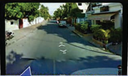
Land 18m x 27m for Sale at $4799/m 2 in BKK 1, Khan Chamkarmorn, Phnom Penh Capital for Serviced Apartment, Hotel and Office Building