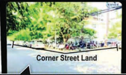
Corner Street Land